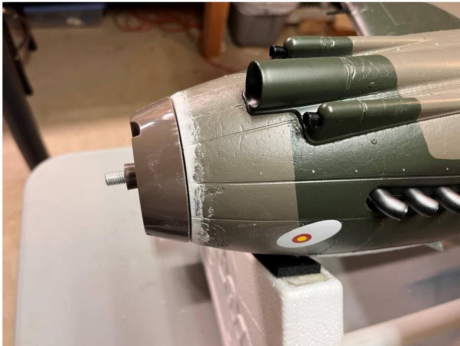
Using the fuselage and the spinners to shape the repairs