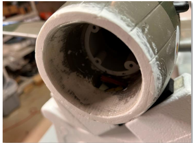
Smoothed out putty with drywall tape and epoxy reinforcement

After drying for a few hours the foam can be cut and roughly shaped with a hobby knife and then sanded for a smoother finish. Sanding will reveal imperfections in the repair and the areas that still need to be filled in, reshaped, or sanded again. I used the spinner plate as a guide to see where more foam putty needed to be added so that the repair would join the contour of the fuselage and the spinner. Several applications of applying the foam putty, shaping and sanding were needed to finally achieve the desired shape.