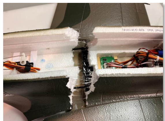
Two halves rejoined with Foam-Tac and carbon fiber rods