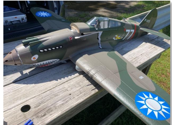
FMS 1400 P-40 damaged after hard landing

The issue with this crash was the damage to the cowling. The unbalanced prop caused the spinner to chew up a sizable amount of the foam in the front of the cowling. It was ugly and needed to be repaired. For this repair I used some lightweight foam putty that I picked up from ABC RC & Hobbies . As an alternative, one could also use a lightweight spackle used to repair and finish drywall. The process can take a while as it may take multiple layers of applying and