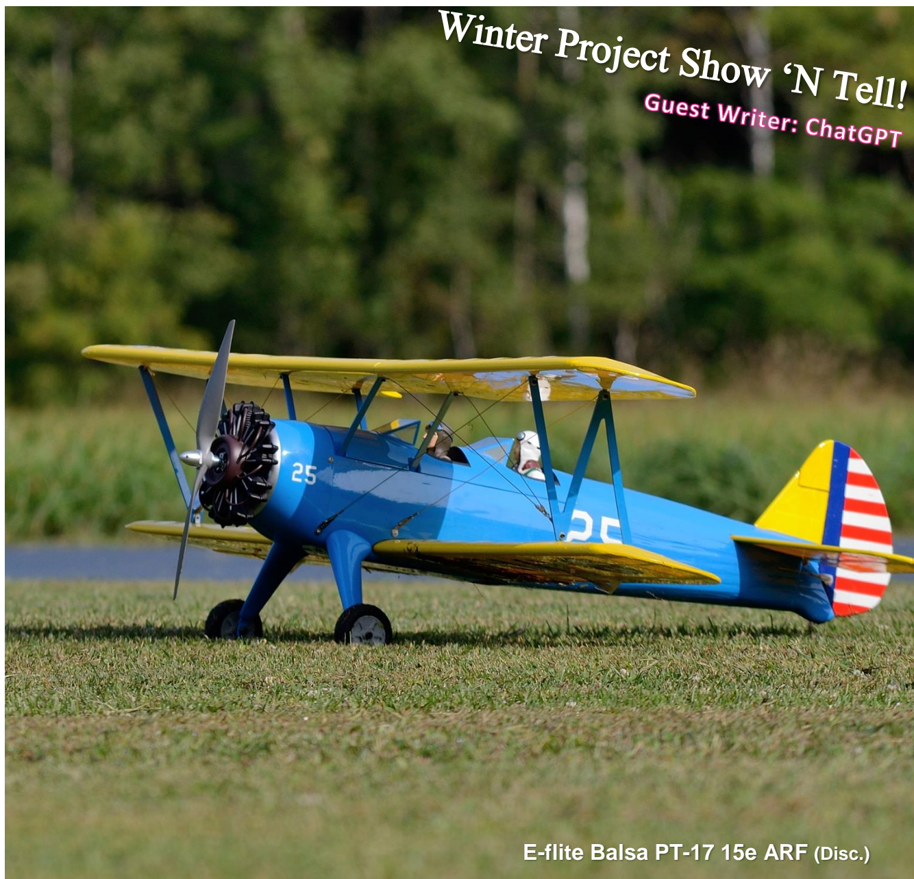
E-flite Balsa PT-17 15e ARF (Disc.)

Winter Project Show 'N Tell! Guest Writer: ChatGPT