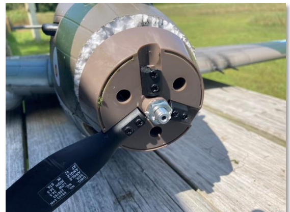
Chewed up cowling