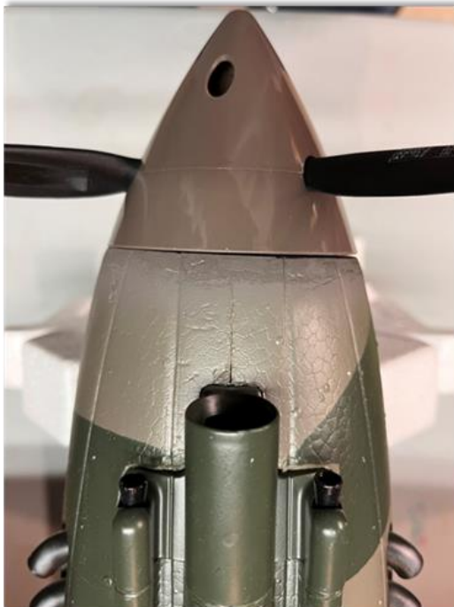
Paint applied to the repaired cowling

Once the foam was repaired to my liking, it was time to paint the putty so the new repairs would not be so obvious. These are just foam planes, after all, so the aesthetics do not need to be perfect. Matching touchup paint to the factory paint is not always an easy task, especially for