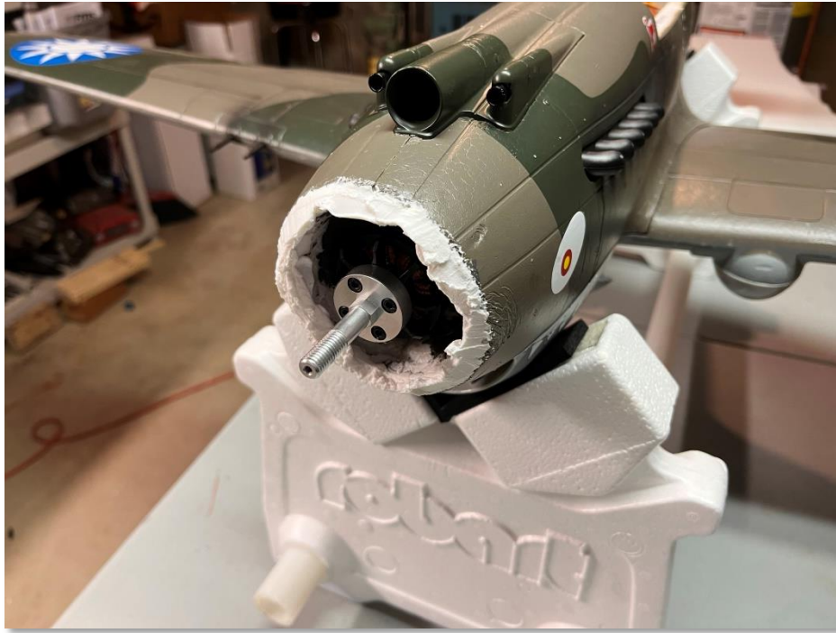
First application of the foam putty. It will be shaped and smoothed out when dried

sanding the foam putty. I started by applying the putty to fill in the foam gaps and leaving extra goops of it sticking out to be reshaped later.