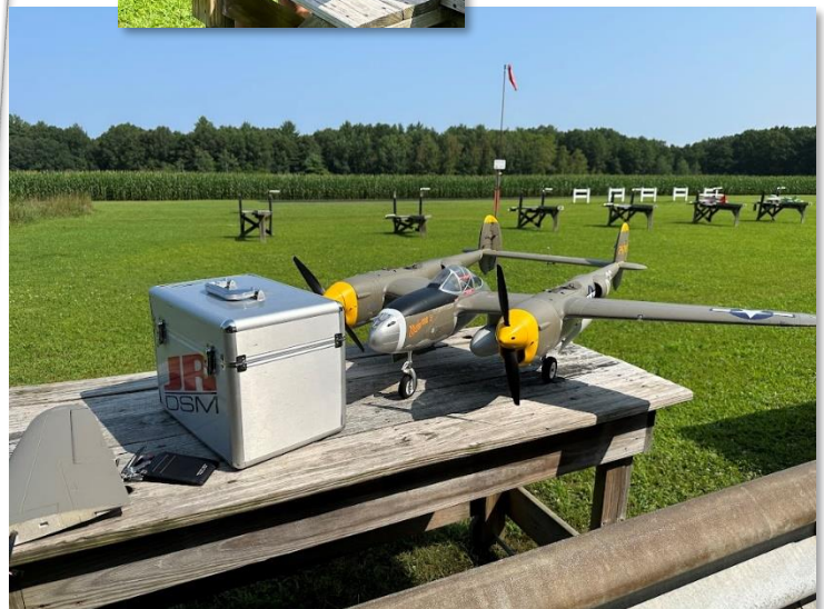
Calvin's FreeWing P-38 Lightning