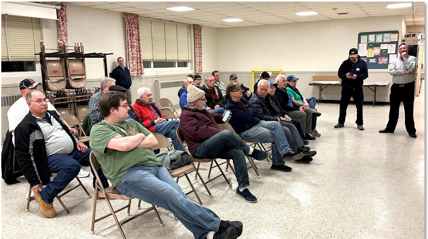
Winter Project Show & Tell ! (4/05/23)