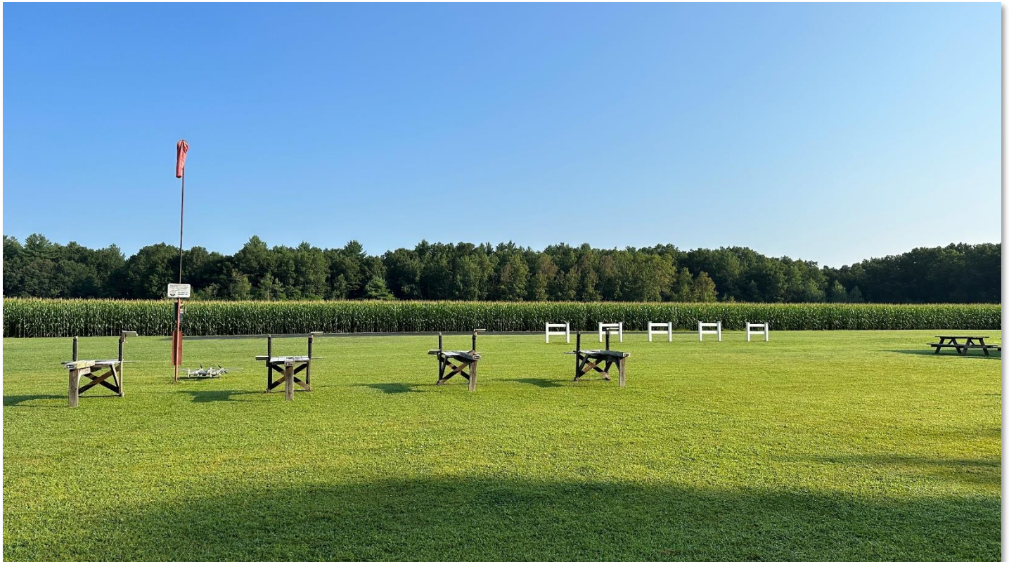
Gorgeous field in the morning (Saturday, Aug 6 th @6:30am)