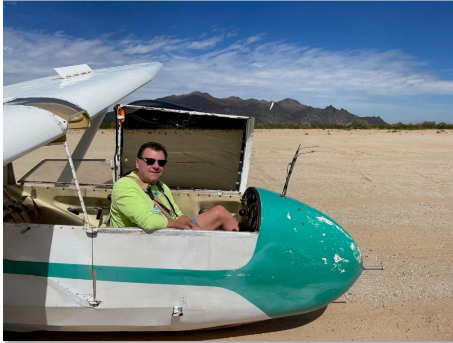
Schweitzer SGS2-33 N2042T

Coming up on April 18 th , we will resume the weekly 'Car Race Night' on Tuesday evenings! A few days later, on April 20 th , we will be resuming our weekly 'Training Night' for airplane and helicopter flight instruction! The plan is to have an informal barbeque of hamburgers and hotdogs at each of these weekly events when the weather permits. These activities are a great excuse to get out of the house on a weekday evening, so please plan to come out and enjoy the fun on Tuesday and Thursday evenings all summer! On April 22, the club will be hosting the 19 th annual Opening Day Celebration and Field Clean-up where we will clean-up the field, and officially kick-off the 2023 flying season at the Ogonowski Memorial Flying Field. The 495 th R/C Squadron, Inc. has always prided itself on the cleanliness of our field, and that of the surrounding neighborhood. During the field clean-up, we will pick up all the trash that has accumulated along Pinnacle St. over the long winter, and generally tidy up the area adjacent to the field. A free barbeque lunch will be served to all participants following the clean-up. Following the cleaning activities, a full day of open flying is planned, and we encourage as many people as possible to attend!!