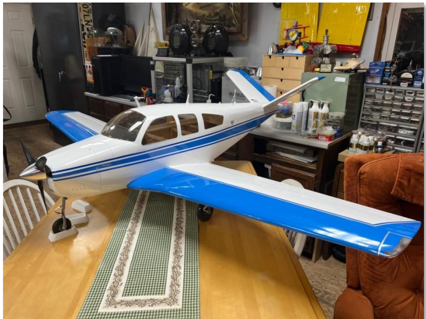
Beechcraft V-35 Bonanza

The long Winter months are always hard for R/C modelers here in New England. The days are short, and frequently cold and windy. Not exactly the conditions that are conducive to getting outside and having fun at the field! For many of us, the monthly meetings are a time to reconnect with our fellow club members – something that must suffice until we can all get back to the field in the Spring! To help pass the long winter months, I've tried to come up with some interesting meeting